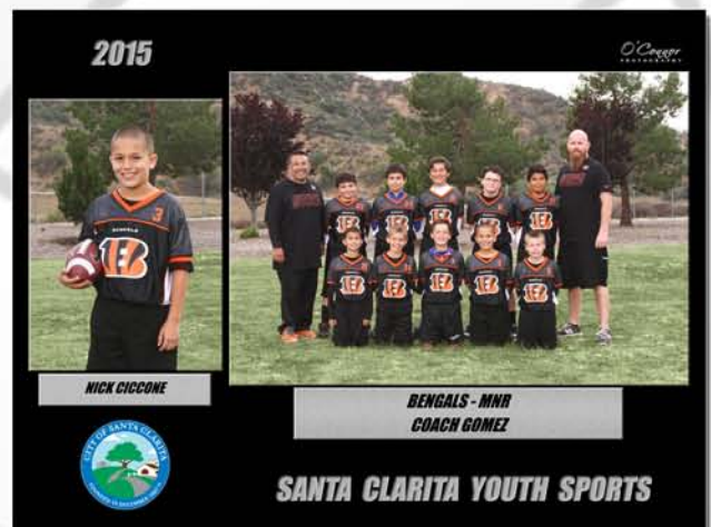
12x16 Framed Composite (PKG F) (5x7 Ind & 8x10 Team in wood frame behind glass)