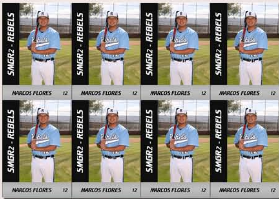
Trading Wallets (PKG N) (Printed on Front only)