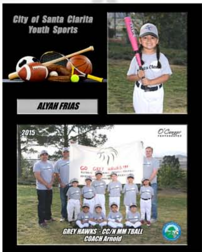
8x10 Composite Photo (PKG G) (Not Framed) (3.5x5 Ind & 5x7 Team)