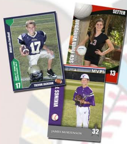
Trading Cards (PKG T) (Printed Front & Back)