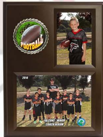
Pro-Plaque (PKG H) (Dark walnut finish, chip resistant surface) (3.5x5 Ind & 5x7 Team pictures)